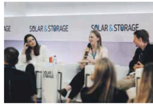
being largely dependent on the weather. This is where storage comes in – stabilising the fluctuations in supply and demand.

However, the electricity produced by renewables is not always completely dependable, especially solar